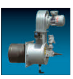
VALUPAK<sup>®</sup> (Europe Only)