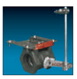
Electrically Operated "CV" Valve